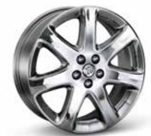
RV8 18" 7-SPOKE CHROMED ALUMINUM