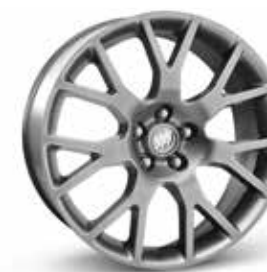
RSZ 18" MIDNIGHT SILVER ALUMINUM ALLOY