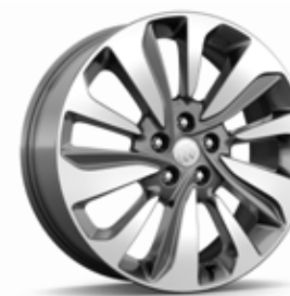
RRU 18" 10-SPOKE ALUMINUM WITH LIGHT ARGENT FINISH